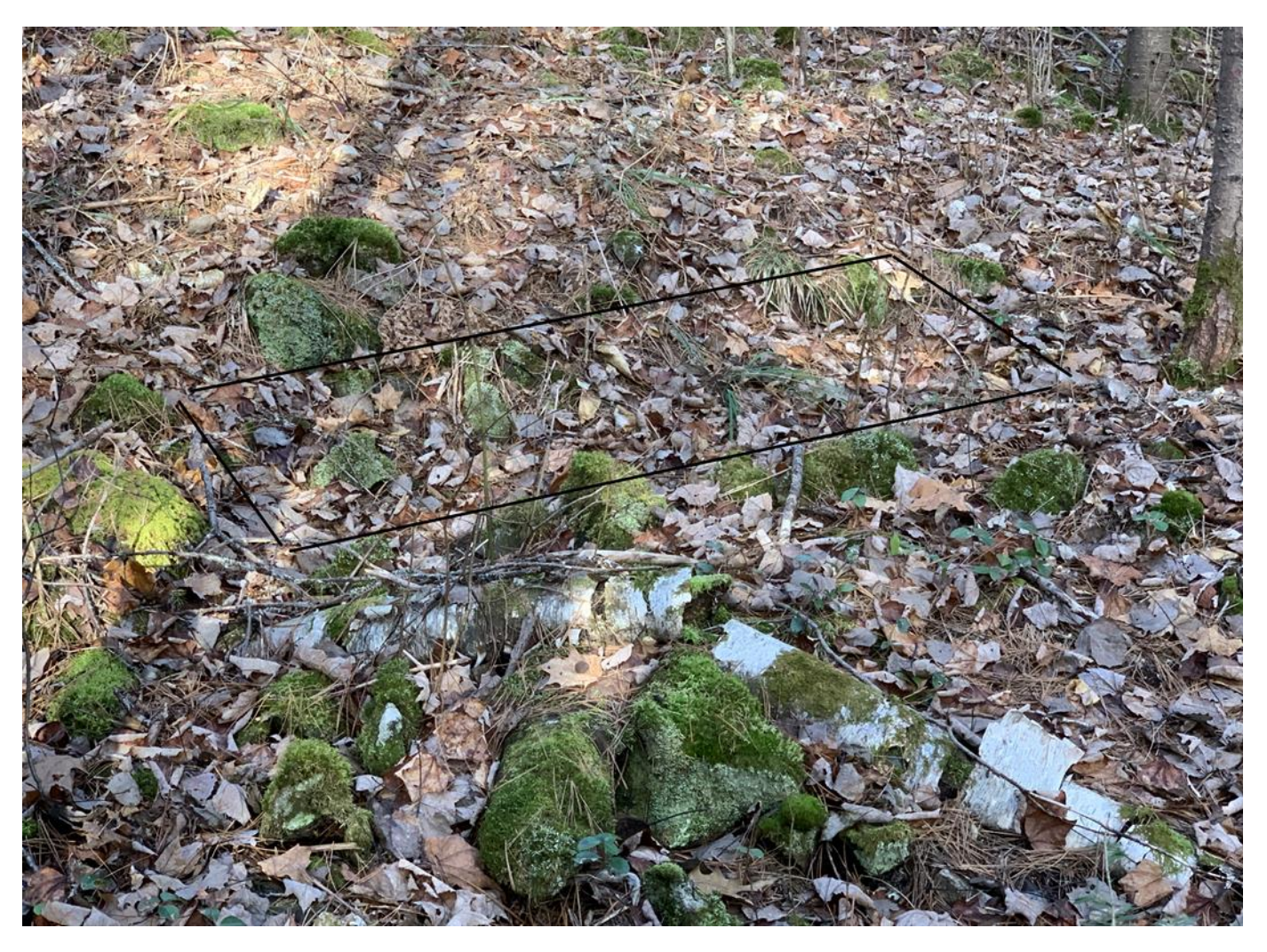
A modern portage on the west side of the Long Lake outlet climbs a steep embankment from Trout Lake. An abnormal depression/disturbed site was observed on the northwest side of the trail as it crests the hill. The disturbed ground was roughly the size of a grave. Potential disturbed site location is shown here: <a href="https://goo.gl/maps/u8FQ9gU5Sis5dBZP8">https://goo.gl/maps/u8FQ9gU5Sis5dBZP8</a>