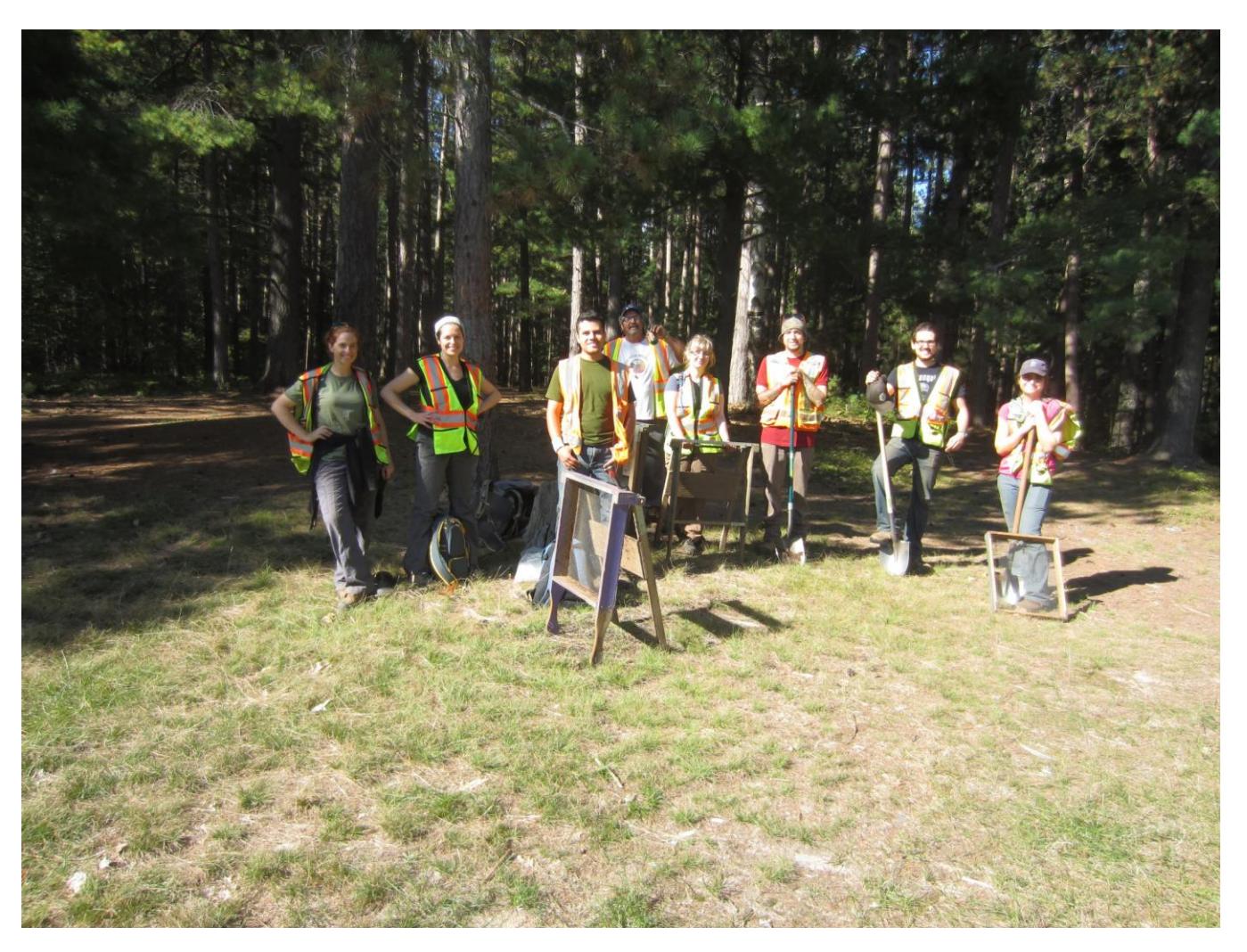
Archeological work was completed on Camp Island by Archaeological Services Inc (field crew shown in picture) in 2016, establishing Camp Island as a provincially significant archaeological site. This has regional implications to surrounding lands.