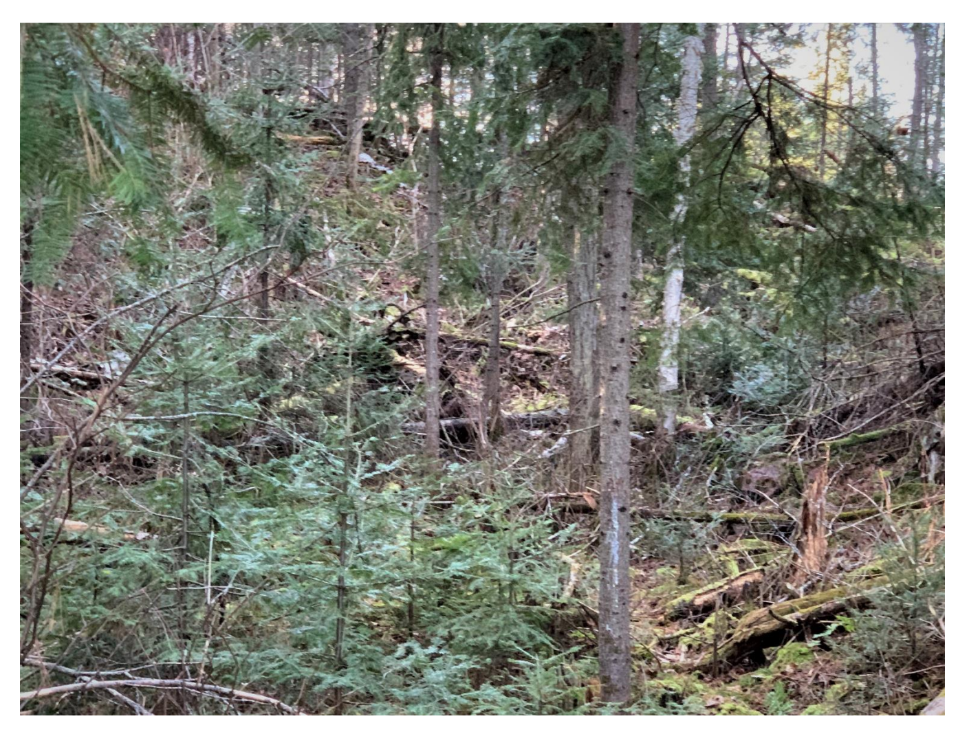
An abandoned gorge about 250 m east of the Long Lake outlet (immediately adjacent to the land claim parcels) is a glacial outlet feature and probably harbours an abandoned portage between Trout Lake and Long Lake.