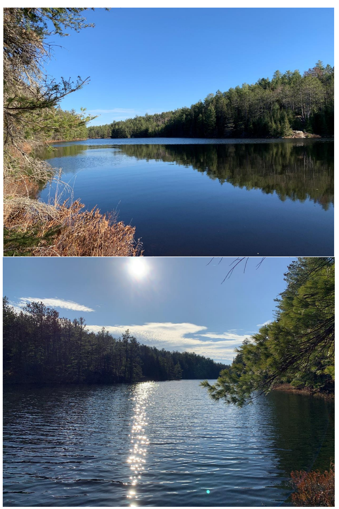
Long Lake is used by small boats, kayaks and canoes. A trail along the northwest shore accesses several camping areas. Several water craft were observed stowed along the shoreline.