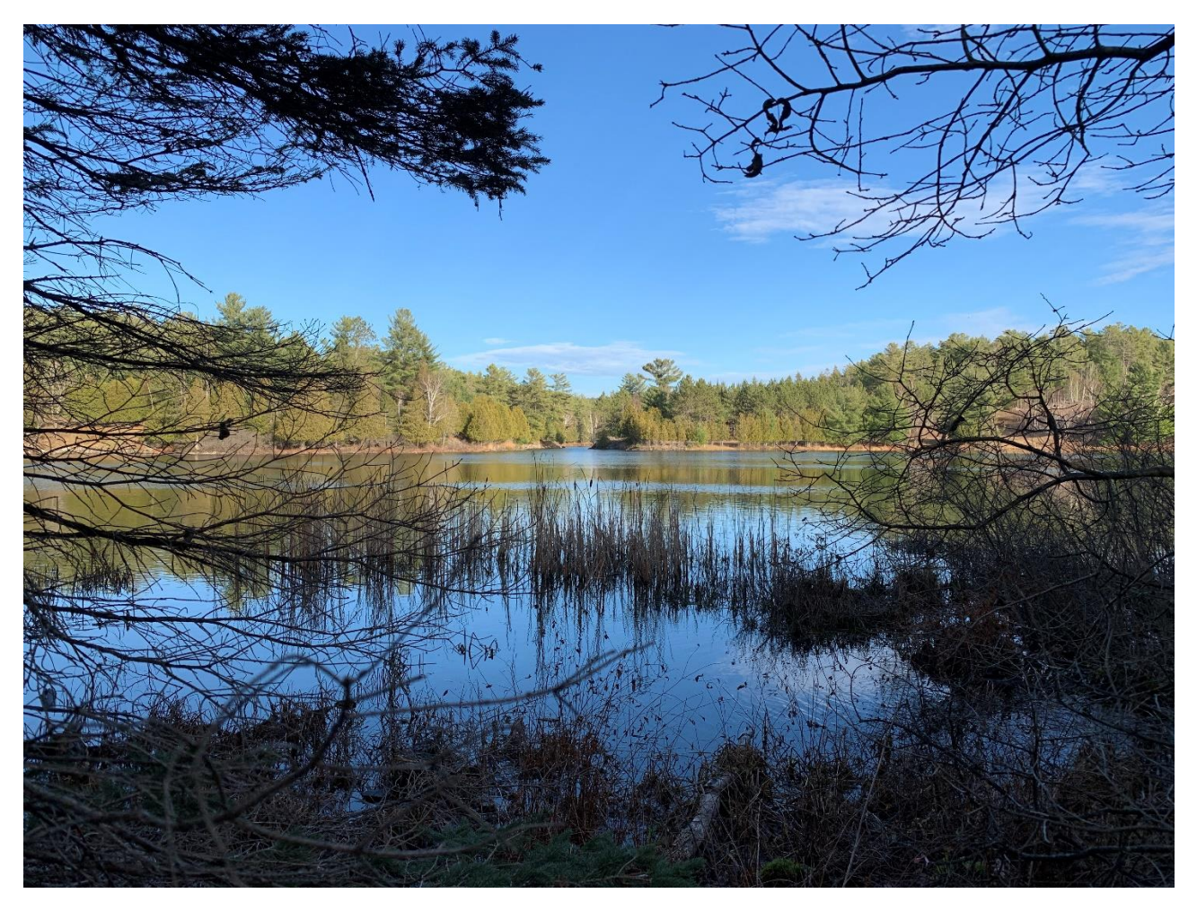
The Long Lake outlet is directly across from the blasted channel into Turtle Lake which is part of the historic voyager route.