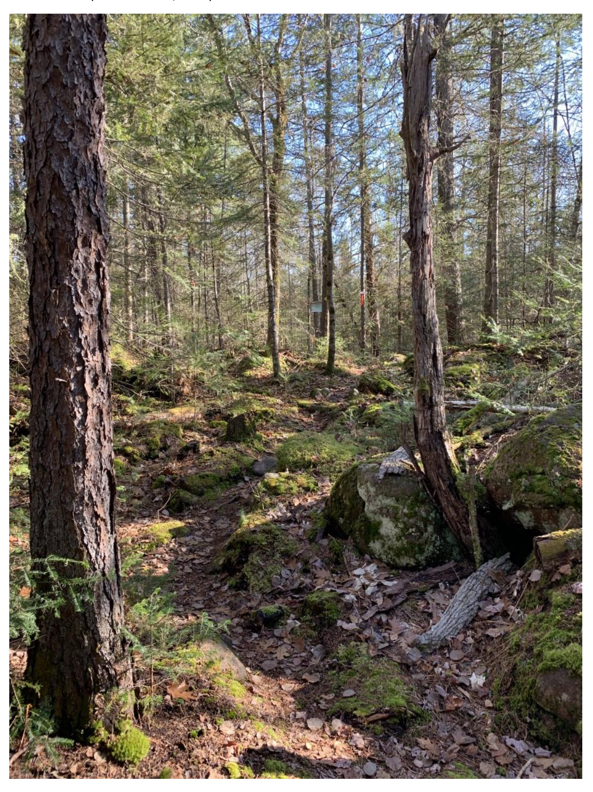
13 km of colour coded and flagged hiking trails. Maps are posted at intersections to provide direction