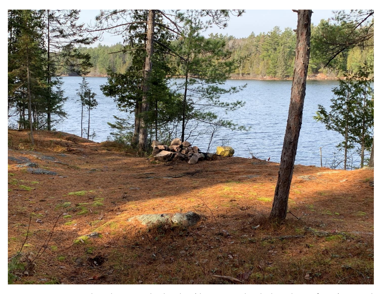
Existing Camping Sites along the Trout Lake shoreline (this one is within the boundaries of 83F2) – several exist between Stepping Stone Lane and the Long Lake outlet (most are accessed via the existing hiking trail system). All suggest long-term use and should be examined for archaeological significance.