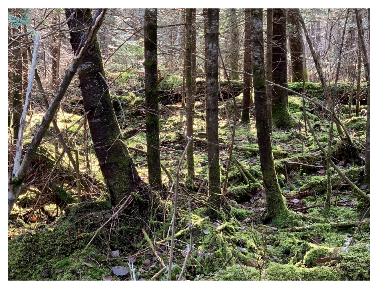
North slopes and heavily shaded areas mainly under conifers have extensive moss growth which is unique in the region.