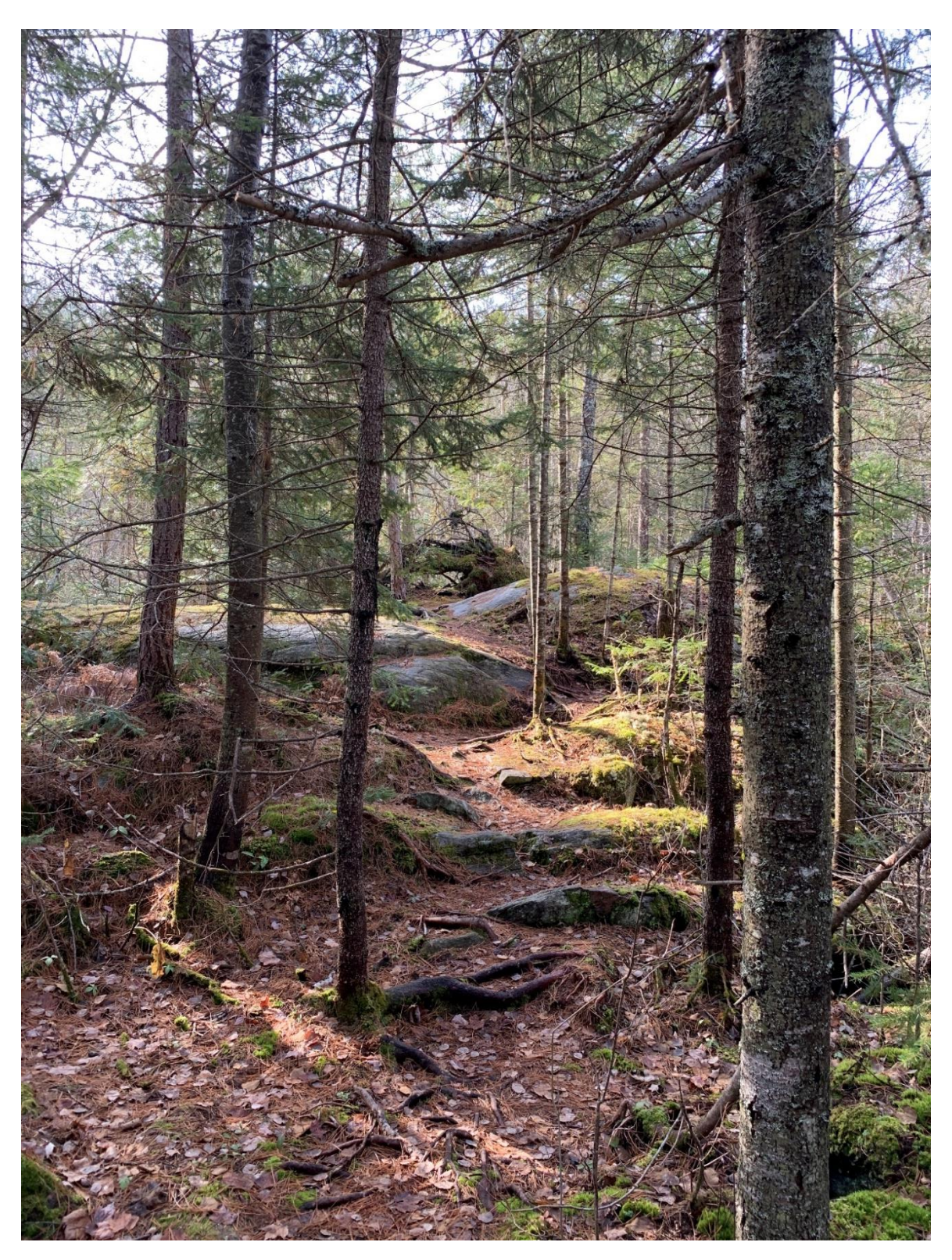
Land is hummocky with thin soil cover. Rolling bedrock ridges are interspersed between linear lakes and wetlands (linear lakes follow minor fault lines). A coniferous forest is dominated by White Pine and Balsam Fir. A mixed forest exists in well drained areas with hardwoods dominating higher elevations. Several ecological zones are present on claimed parcels.