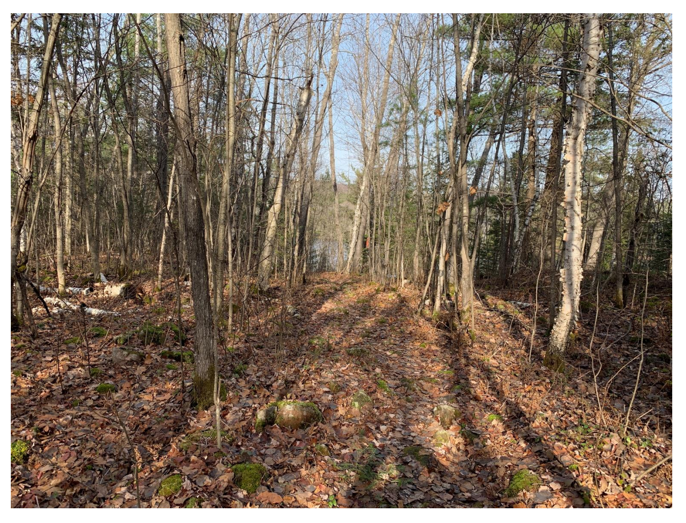
As illustrated on the trail map, this widened portion of the trail is used as a portage between Trout Lake and Long Lake in the summer and is part of a major regional snowmobile trail network in the winter.