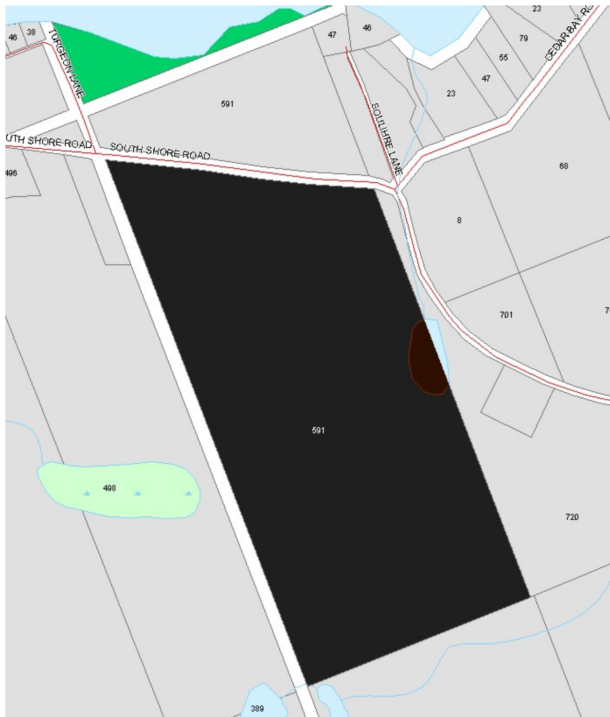
Figure 1: Property Location